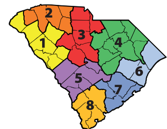
Figure 1. 2011 S.C. DHEC health regions